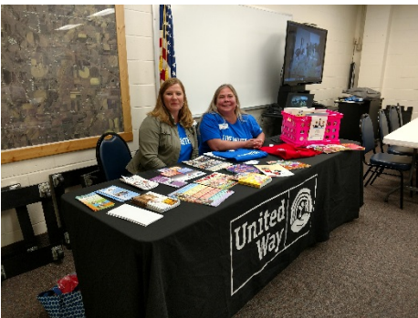
United Way Representatives

dined and then played games including Bean Bags, TP Toss, Connect Four, and Golf, with contributions being made throughout the event to the United Way for Wadena County. Proceeds from the event go directly to help families in Wadena County. Employees could make a direct contribution or could choose to allow a payroll deduction each pay period to become a continuous donor to the United Way.